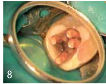
Figure 6: Pre-endodontic restoration.