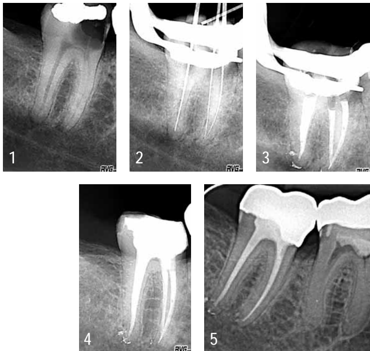
Figure 1: Initial radiograph, caries profunda, strong defect in substance and periradicular distal periodontitis.

In the eyes of the patient, a dentist's competence begins with transparent information. The patient should be informed about different therapeutic alternatives including a relevant risk to benefit profile, which translates to a cost to benefit ratio. In the end, it is the patient, a mature, educated and therefore equal partner, who makes the therapeutic choice.